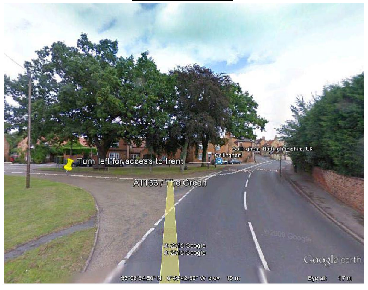
Then carry on forward until the road splits you turn right on to Low Street & drive for about half a mile

If you are arriving into Collingham on the A1133 from Newark on Trent as you arrive into the village you turn left at The Green