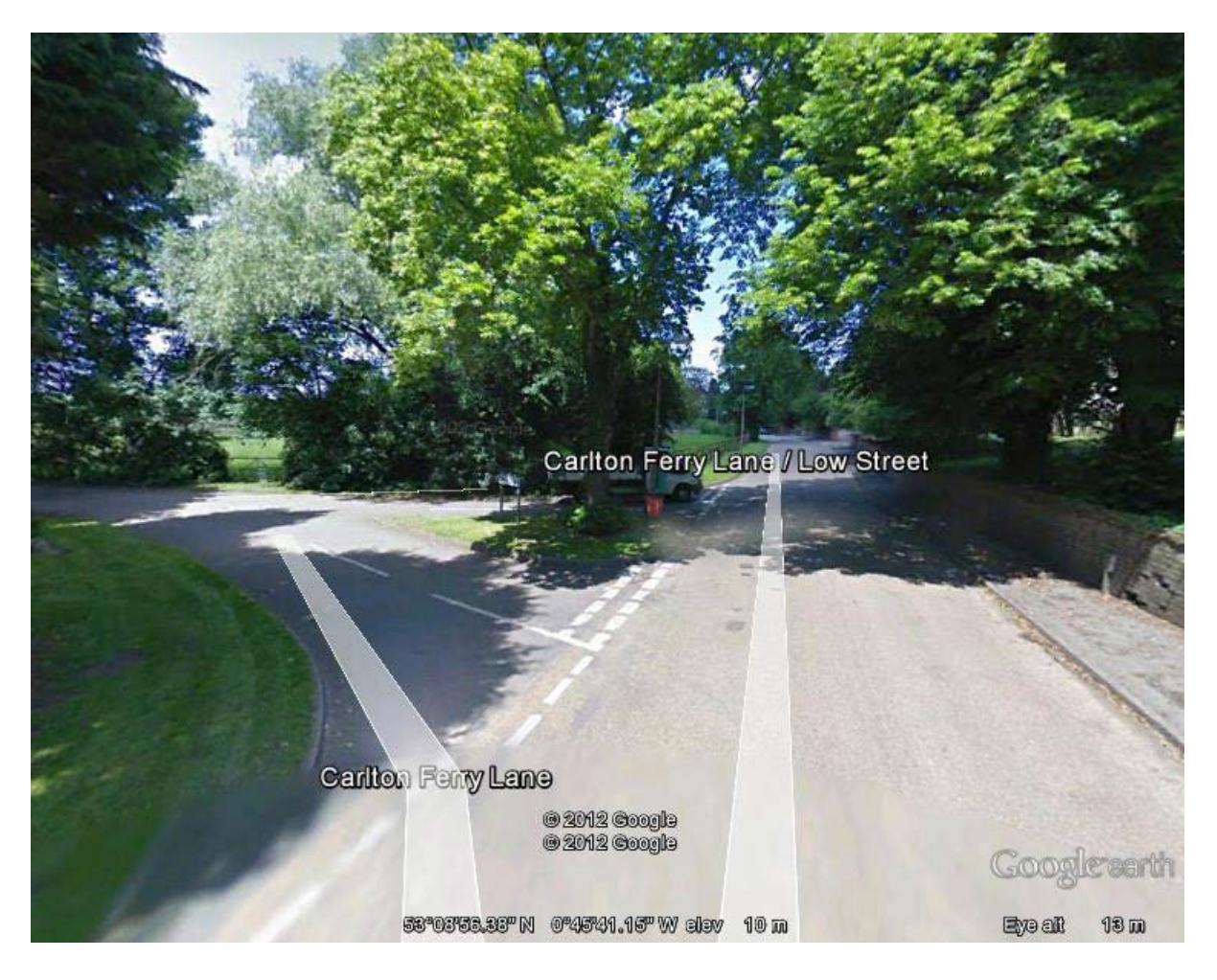
Then if you want to fish pegs 52-110 turn in here and drive up to the flood bank turn left and drive and park behind your peg