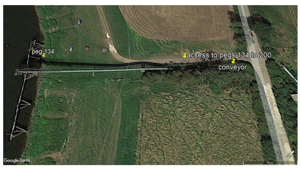
If you want to fish pegs 200-263 then drive straight on

Then if you want to fish pegs 264-305 turn left open the gate and go through the gate then close the gate and drive to the car park and walk to your peg