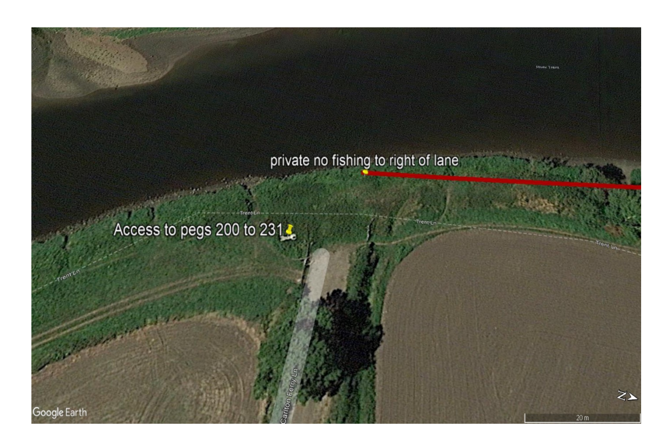
No fishing to right of lane members only please take your rubbish home with you

Then walk and carry your gear to your peg