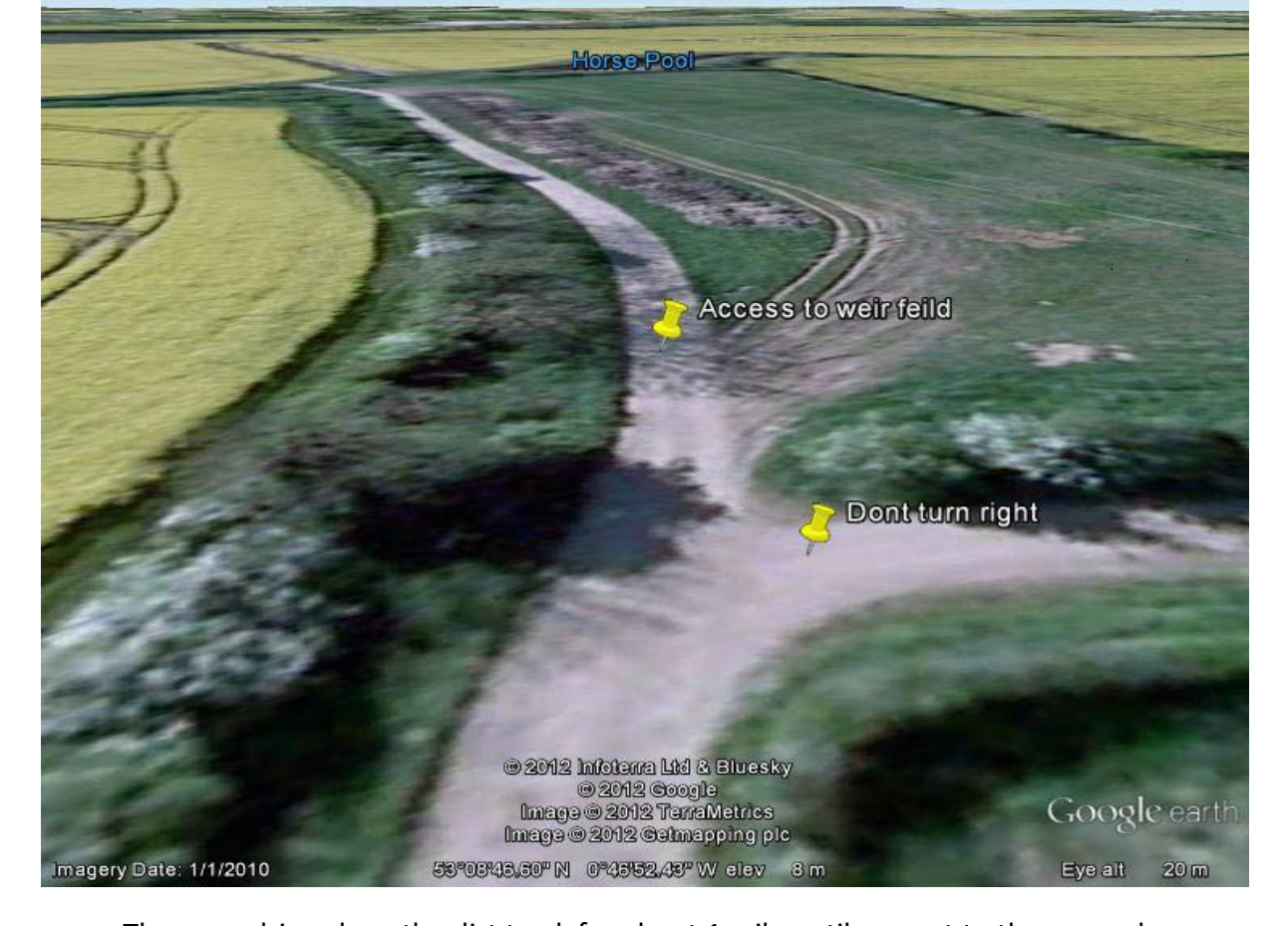
Then you drive along the dirt track for about 1 mile until you get to the car park Park up and walk to your peg and carry your gear to your peg no parking behind your peg