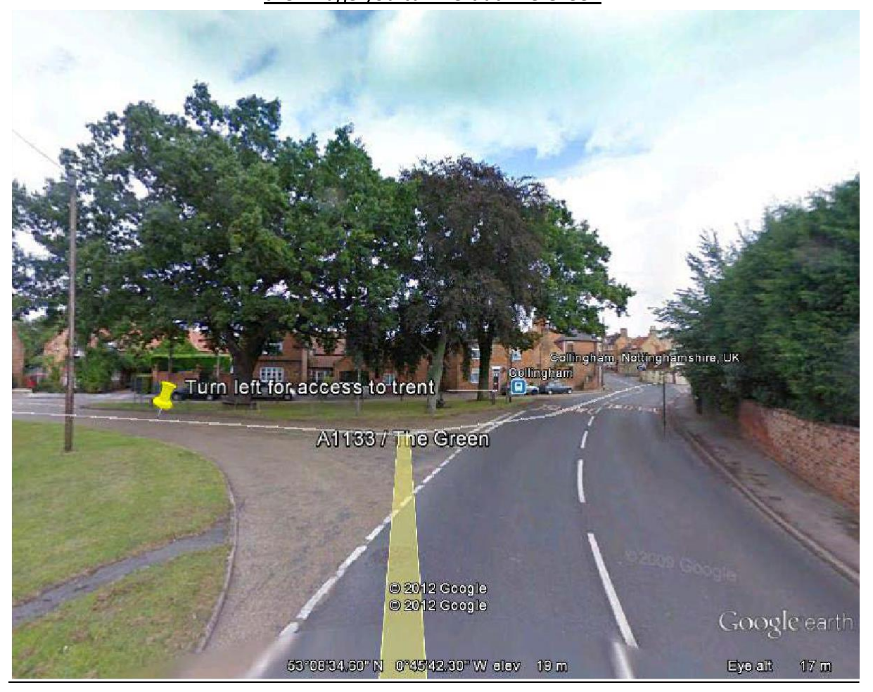
Then carry on forward until the road splits you go straight ahead

If you are arriving into Collingham on the A1133 from Newark on Trent the as you arrive into the village you turn left at The Green