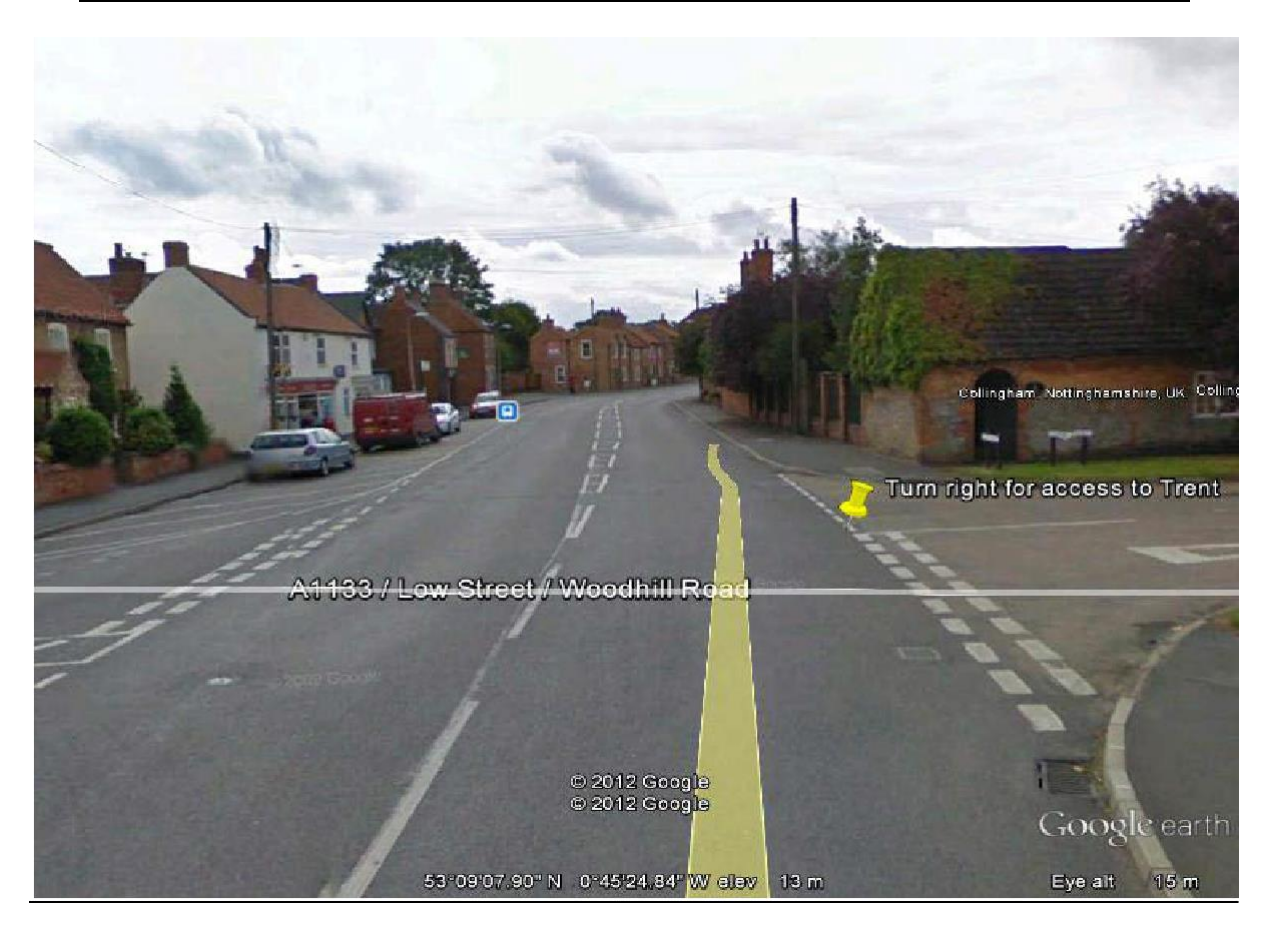
Then the North Collingham church will come up on your left-hand side you go straight on for half a mile

If you are arriving into Collingham on the A1133 from Dunham on Trent the as you arrive into the village you turn Right at the cross roads on to Low Street travel about ½ mile