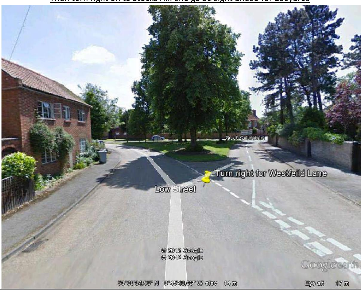
Then turn right on to Westfield Lane

Then turn right on to Stocks Hill and go Straight ahead for 100yards