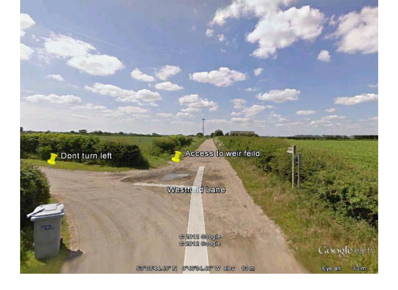
Then come to a split in the road you go straight on